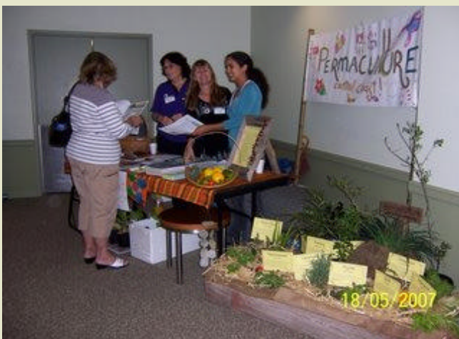
Part of the companion planting display

A few members put together a display on companion planting, this was our very first display and it was fantastic.